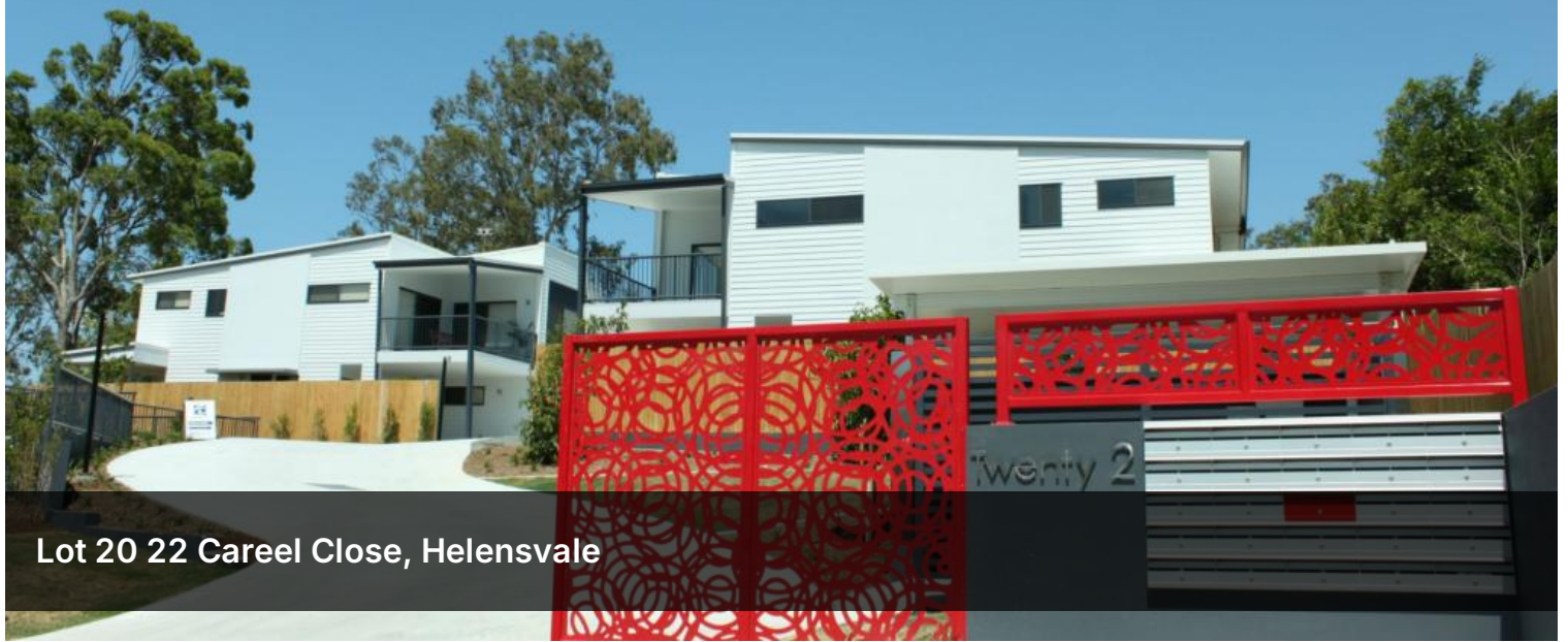
Lot 20 22 Careel Close, Helensvale